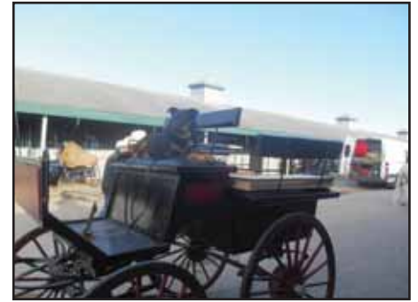
Maizy waiting for hookup

If you are planning to attend the 2016 National drive, the camp ground will be very crowded with Trick or Treaters as they are having their Halloween event. Early reservations are a must. if you are planning on camping at the horse park.