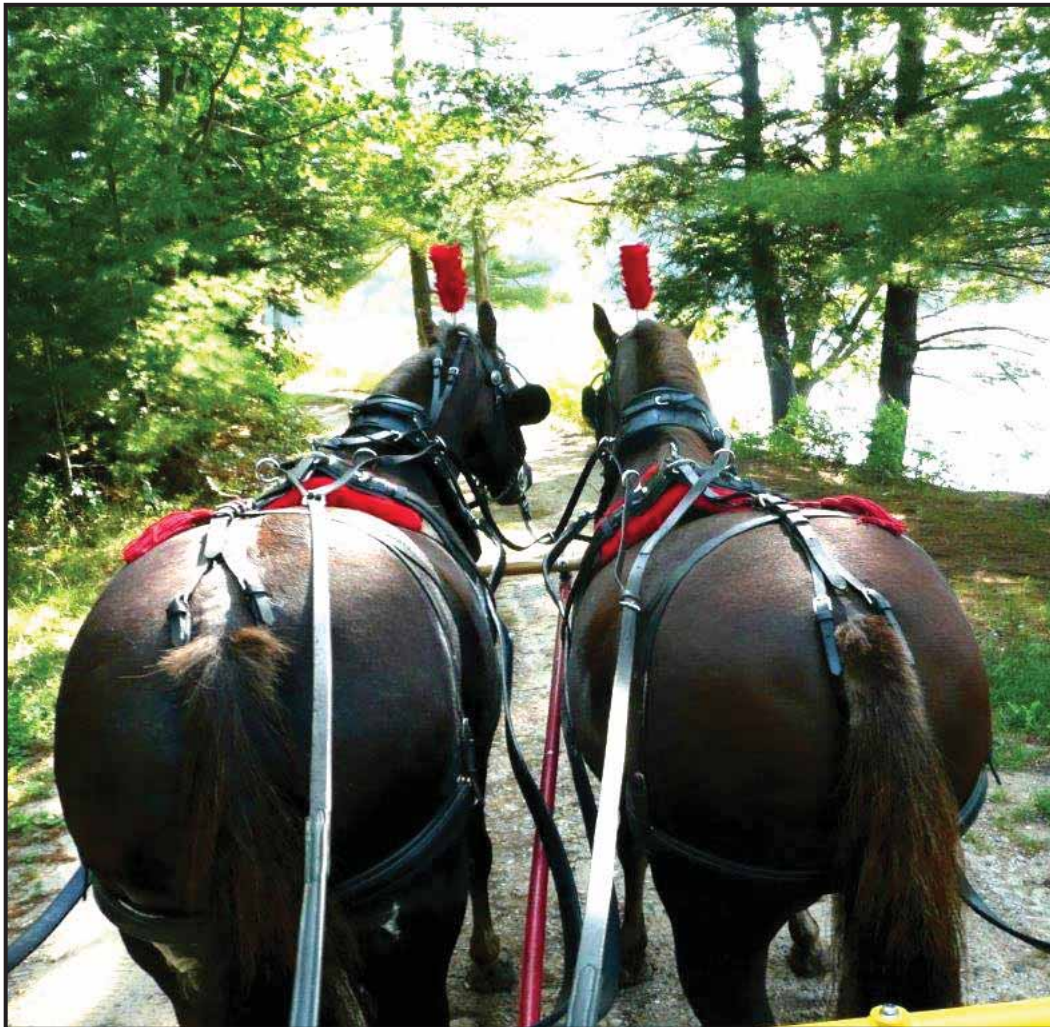
Willow & Patriot at the Lake in Lake City