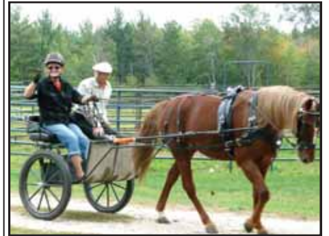
After a full day of driving, food, friends & a warm fire is a wonderful way to end the day.